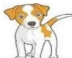
a dog .....