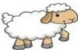
a sheep .....