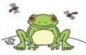
a frog .....