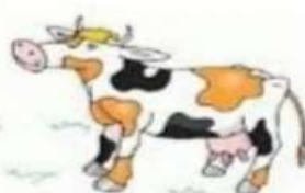
a cow .....