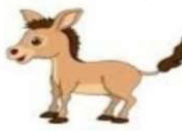
a donkey .....