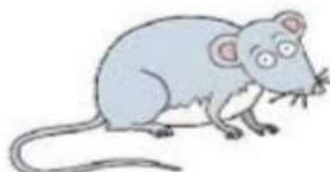
a mouse .....