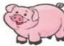
a pig .....